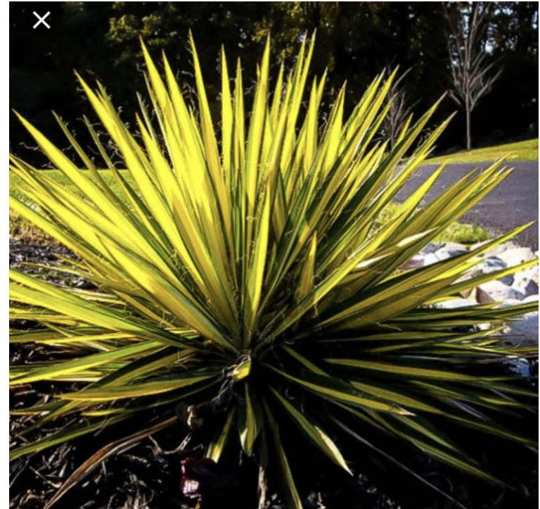
Yucca Plant: $49.99 Approx. These are not in nurseries yet due to time of year.